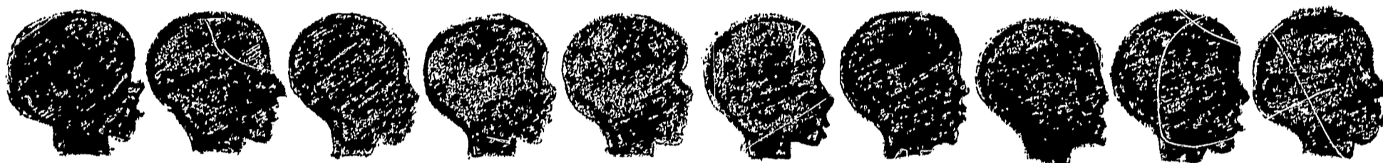
One Two Three Four Five Six Seven Eight Nine Ten

60. Look at the drawing above. Make believe that they are pictures of some of the children in your class. The first child, number one on the numbers below the picture, is the best liked boy or girl in the class. The least liked one is number ten. I want you to decide about where you belong in the line and put a circle around the right number. If you think you are the best liked person in your class, put a circle around number two or three. If you are near the middle, you might circle four, five, or six. The least liked you are, the higher the number you should circle on the row of numbers. If you think you're near the least liked, but not quite, you circle number nine. If you are the least liked of all the children, circle number ten.